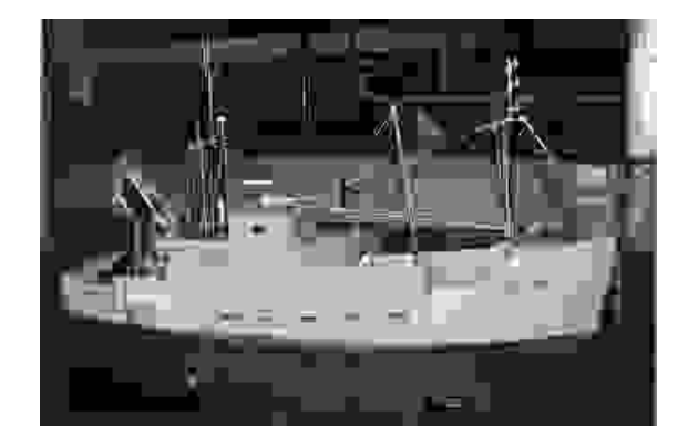
Figure 2. Westhaven model prepared for testing, with liferafts on the focsle and shelter.

The models incorporated watertight bulkheads, hatches, doors and vents in order that the flooding process, and therefore the sinking attitude, would be representative. The Westhaven model was ballasted to represent the estimated condition of the vessel prior to sinking, and the beam trawler was ballasted to a condition which just met the UK stability requirements.